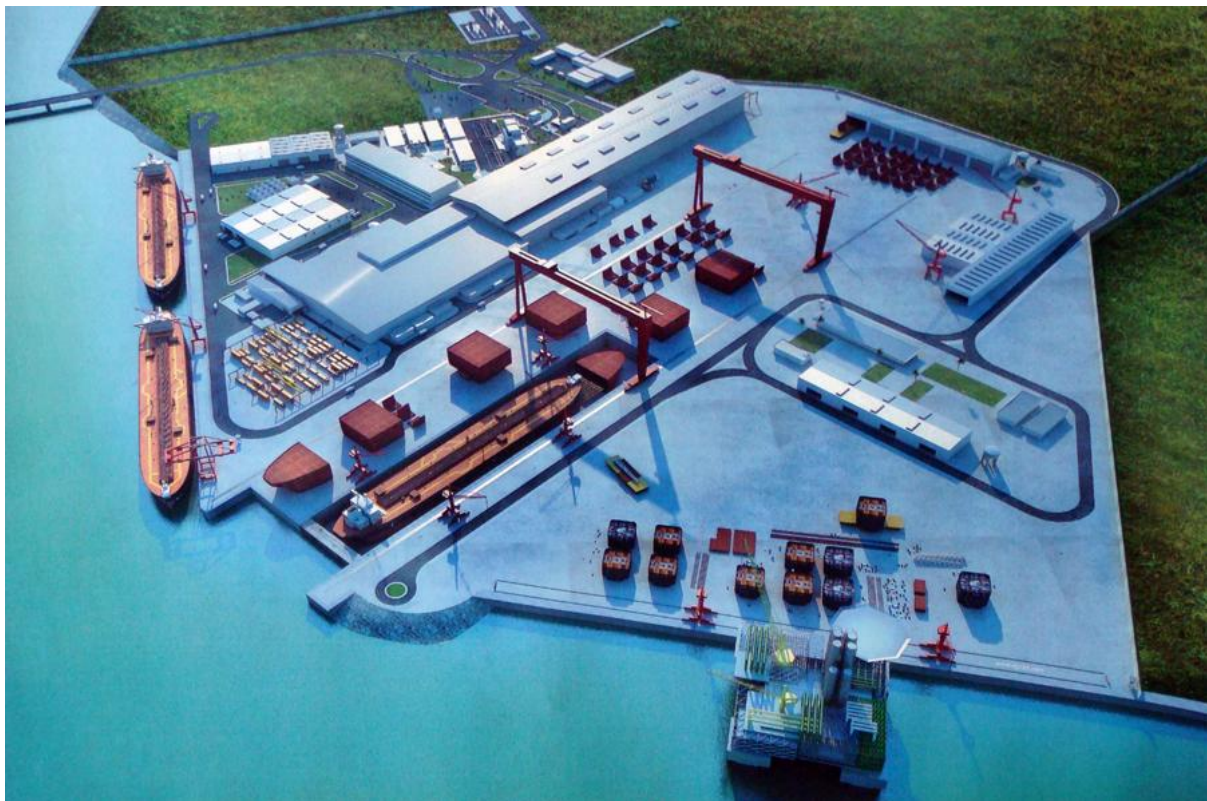
Fig.2: Rendering of EAS Shipyard which is the largest in Latin America

The shipyard currently has an order book of $3.4 billion USD for 14 Suezmax tankers, 8 Aframax tankers as well as the hull of a P55 semi-submersible platform, França (2009) .